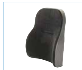
Deep contour backrest