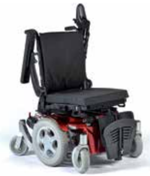
Flip-up armrests and foot rests for easy accessibility