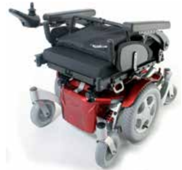
Lift-off backrest for easy transportation and storage