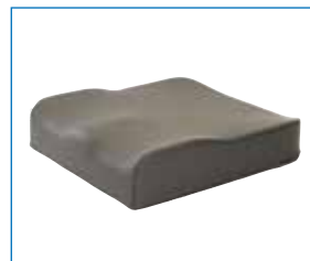
Optimum comfort cushion