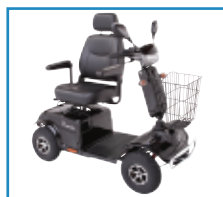
Waterproof Panel and Twin Mirrors