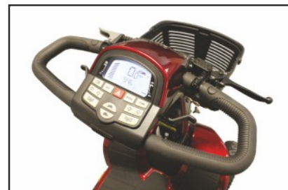
NEW LCD console with speed sensor (standard)