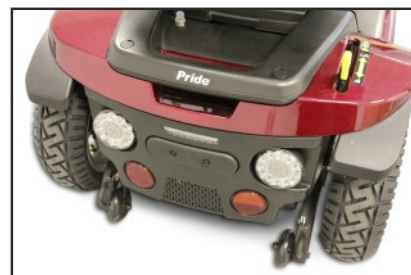
NEW rear LED lights