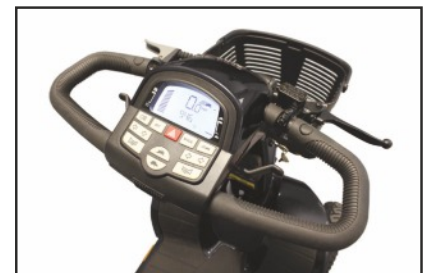
NEW LCD console with speed sensor (standard)