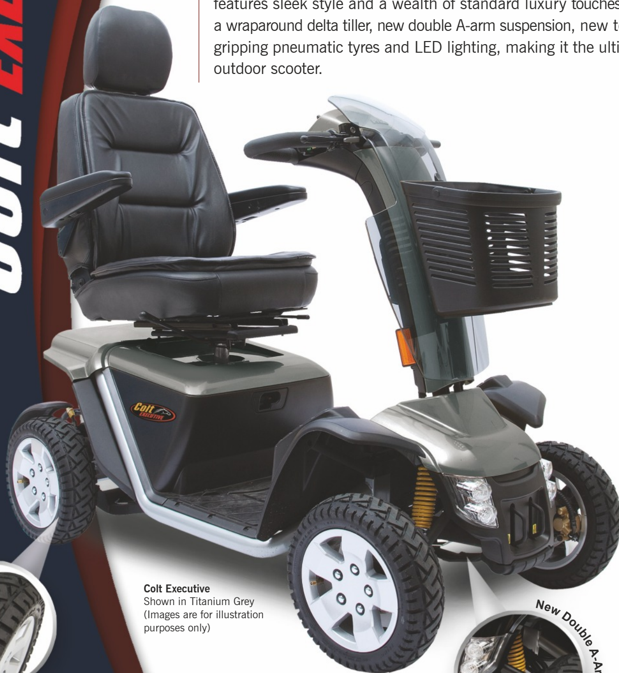
Colt Executive Shown in Titanium Grey (Images are for illustration purposes only)

Bristling with high-performance features like full suspension, low-profile tyres and a hydraulic sealed brake system, the Colt Executive is a blend of power and precision. The Colt Executive features sleek style and a wealth of standard luxury touches like a wraparound delta tiller, new double A-arm suspension, new terrain gripping pneumatic tyres and LED lighting, making it the ultimate outdoor scooter.