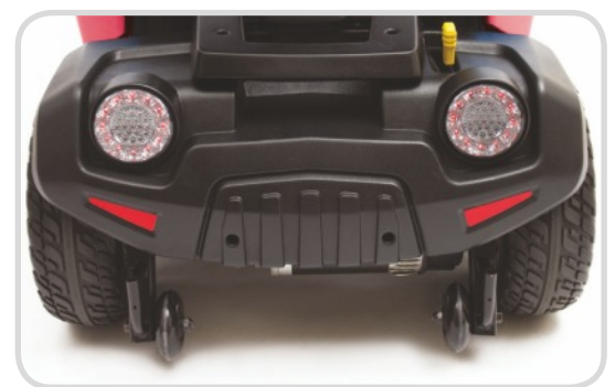
Rear LED lights

Pride Mobility Products BV — LIVE YOUR BEST —