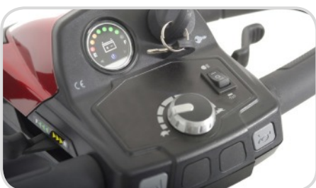
Delta tiller with wraparound handles

PRIDE® MOBILITY SCOOTERS LIVE YOUR BEST®